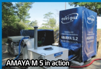
AMAYA M 5 in action

Both units are also used for emergency drinking water supply in case of an emergency or to provide drinking water for a pre-planned sports, cultural and other events.