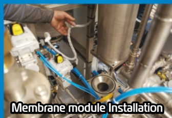
Membrane module installation