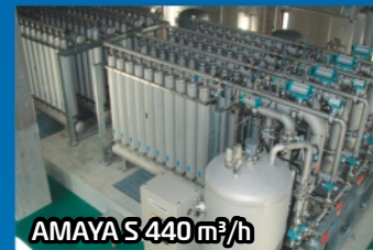
AMAYA S 440 m 3 /h