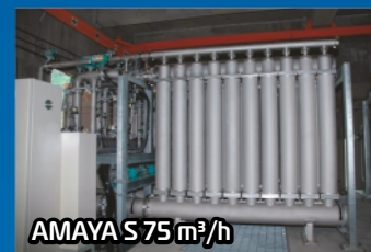
AMAYA S 75 m 3 /h

** Indicative parameters, which may vary depending on the technical layout and scope of delivery